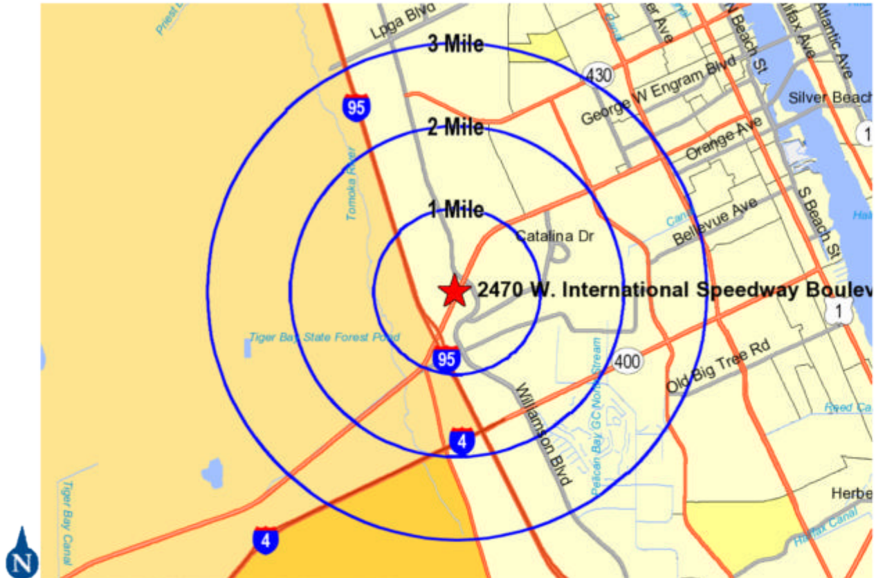
Demographic data © 2008 by Experian/ Applied Geographic Solutions.