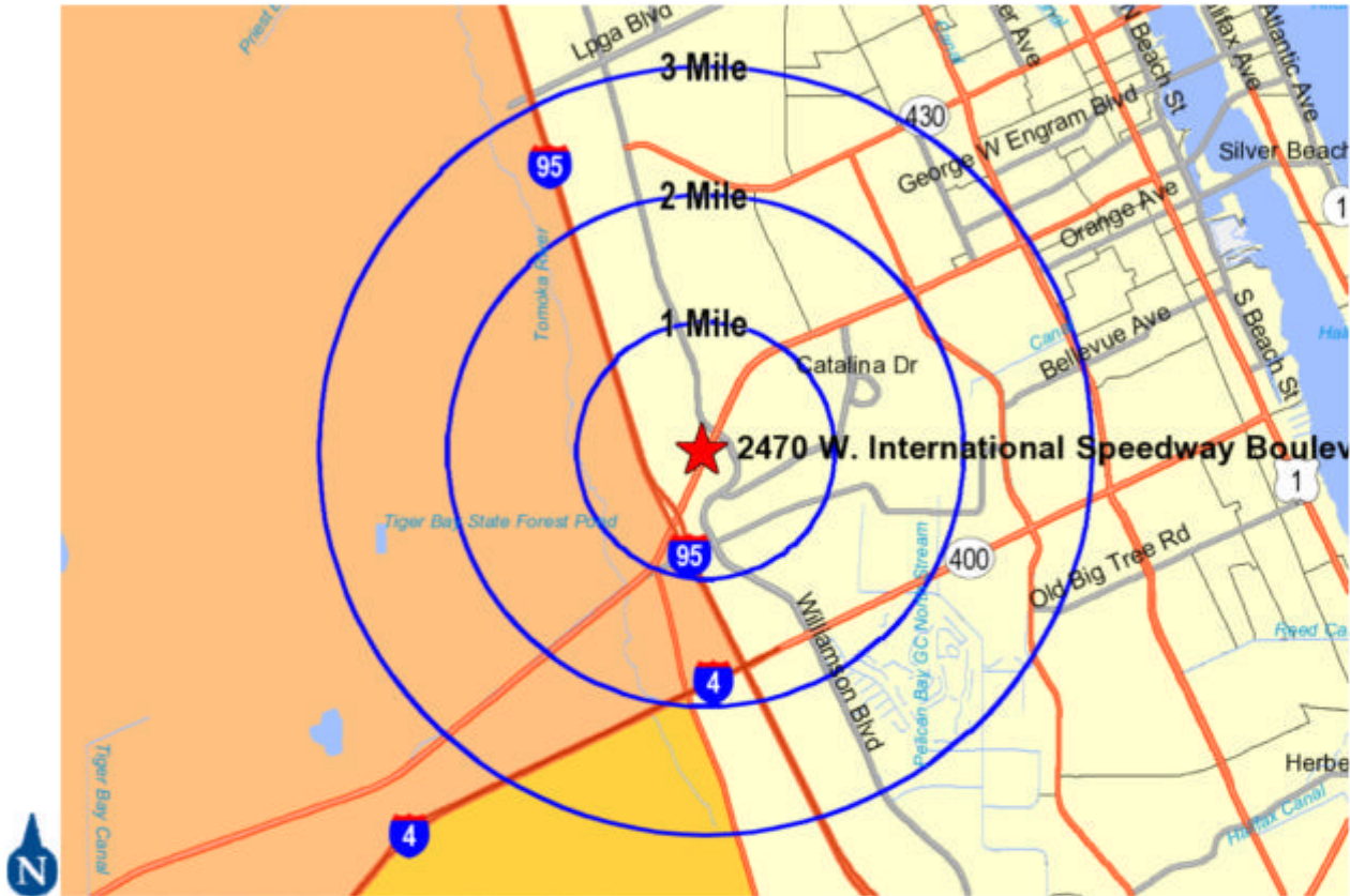
Demographic data © 2008 by Experian/ Applied Geographic Solutions.